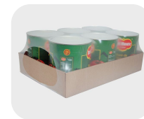
Bundled package with bull's-eye style open ends