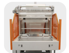
Efficient product loading using adjustable height entry conveyor