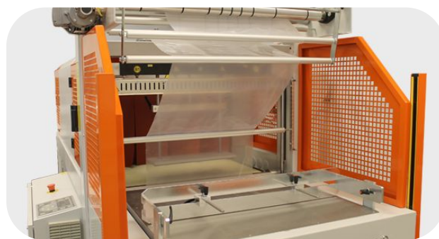
The Clamco 7130MSW Sleeve Wrapper Bundler is a semi-automatic shrink packaging system designed for superior performance, capable of wrapping up to 10 packages a minute.